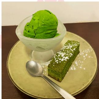
Matcha Ice cream with Matcha Brownie