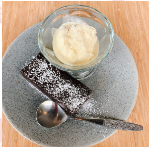
Vanilla Ice cream with Chocolate Brownie