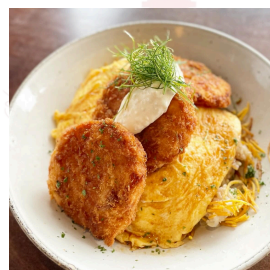
Katsu Prawn Cakes (Egg)