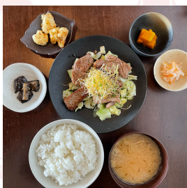
Yakiniku Beef Gozen