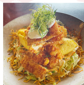
Katsu Chicken (Salad & Ex Egg)