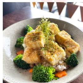
Teriyaki Tofu (Veges)