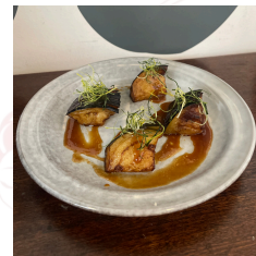
Eggplant Miso sauce