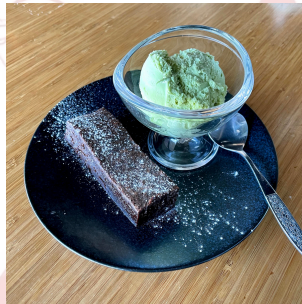
Matcha Ice cream with Chocolate Brownie