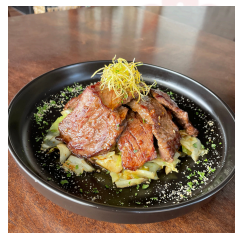
Yakiniku Beef Stack