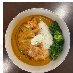
Katsu Chicken Curry

White Rice $3 Miso soup $4 Rice & Miso soup Set $6 Extra sauces, dressings 50c