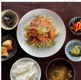
Teriyaki Chicken Gozen

Teriyaki Salmon $39 Pan fried NZ salmon w Tartare