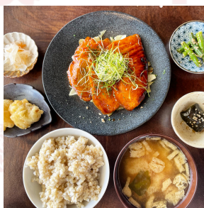
Teriyaki Salmon Gozen