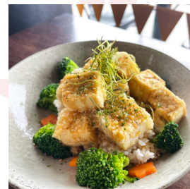
Teriyaki Tofu (Veges)