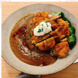
Katsu Chicken Curry

Request your favourite level of spiciness!