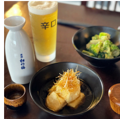
Agedashi Tofu Broccoli Goma