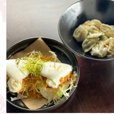
Bao Buns Vegan Gyoza