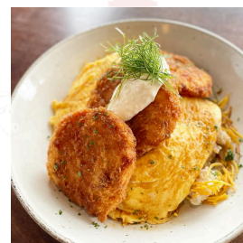
Katsu Prawn Cakes (Egg)