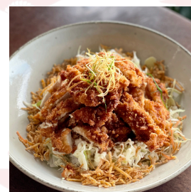
Katsu Chicken (Salad)