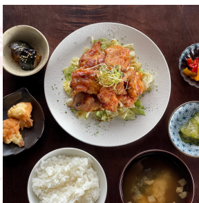
Teriyaki Chicken Gozen