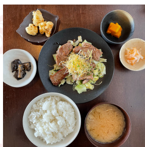
Yakiniku Beef Gozen